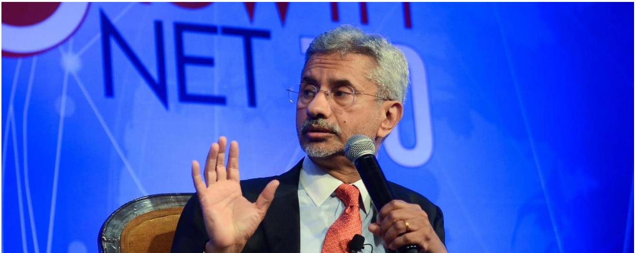
Minister of External Affairs S Jaishankar during the 7th Growth Net Summit in New Delhi.

Our second choice is an article by our chief strategy officer on the hypocrisy of Western media in its coverage of India's foreign policy on the Russia-Ukraine War.