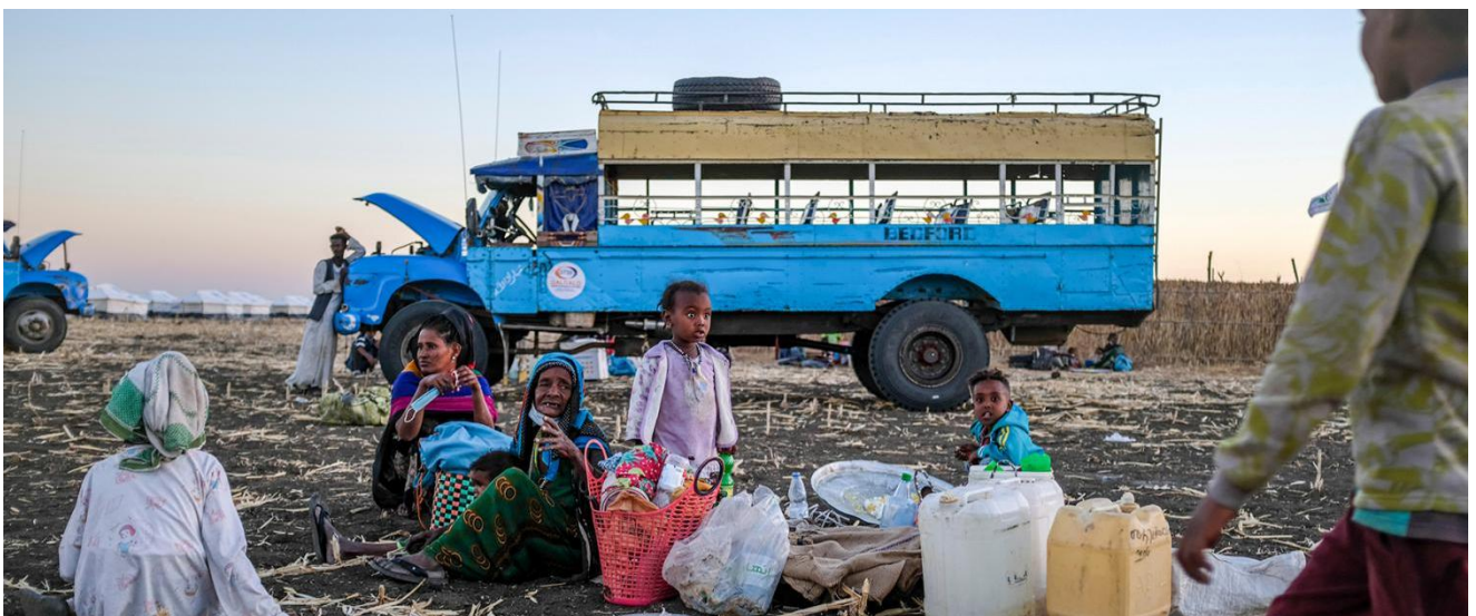
An Ethiopian refugee family waiting for help

Our third choice is an interview of the former head of the Africa desk for the BBC World Service. He shines the light on the Tigray War in Ethiopia, which has not received much coverage in contrast to the Russia-Ukraine War.