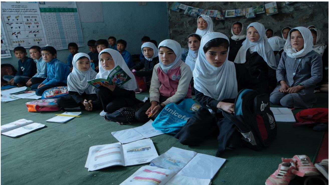
Afghan girls attend school in Herat, Afghanistan, 2019

Our top choice is a letter to the United Nations. We were the only media organization in the world news space that published this letter on the request of our friends from Afghanistan. We turned this piece overnight with team members in the US, the UK and India working together to put it up online.